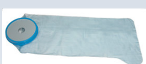
Lg Pediatric Leg