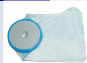
Med Pediatric Leg