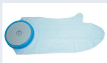
Med Pediatric Arm