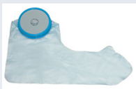
Lg Pediatric Arm